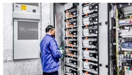
ABB is an industry leader in developing higher-voltage components to meet the needs of energy storage applications. We offer an extensive range of equipment